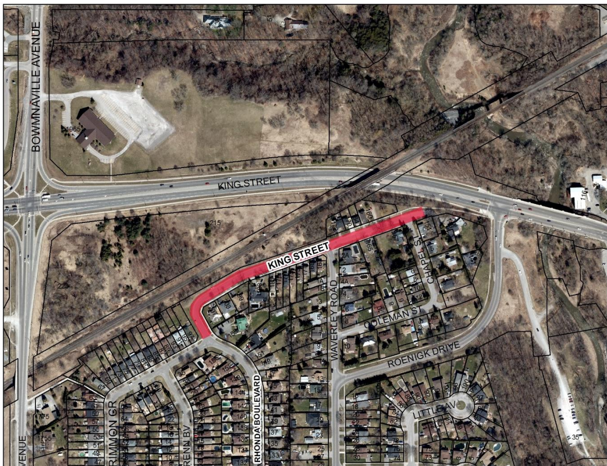
Figure 2 – Existing King Street remnant in Bowmanville under consideration