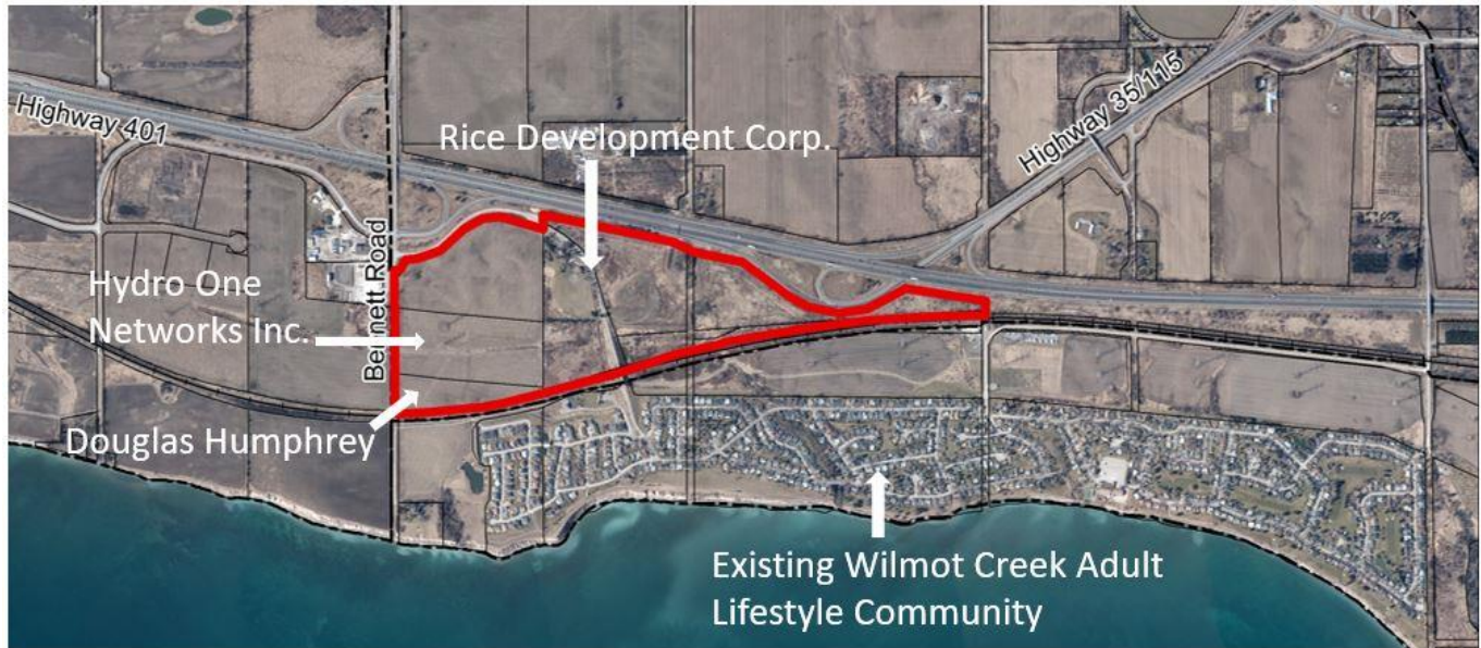
Figure 1: Wilmot Creek Neighbourhood Secondary Plan Area