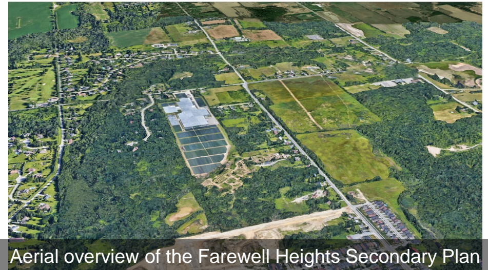
Aerial overview of the Farewell Heights Secondary Plan Area