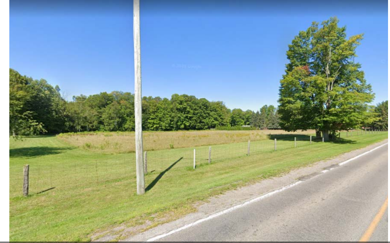
Southeast corner of Pebblestone and Trulls Road