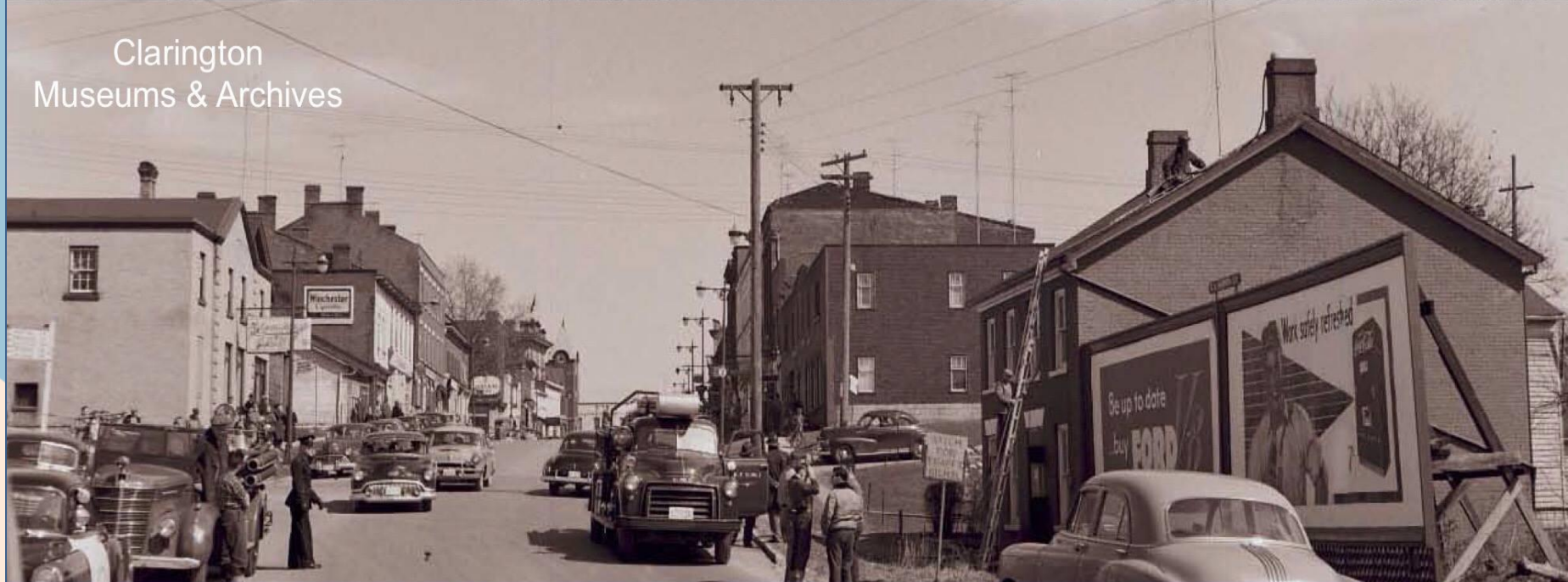
Clarington Museums & Archives