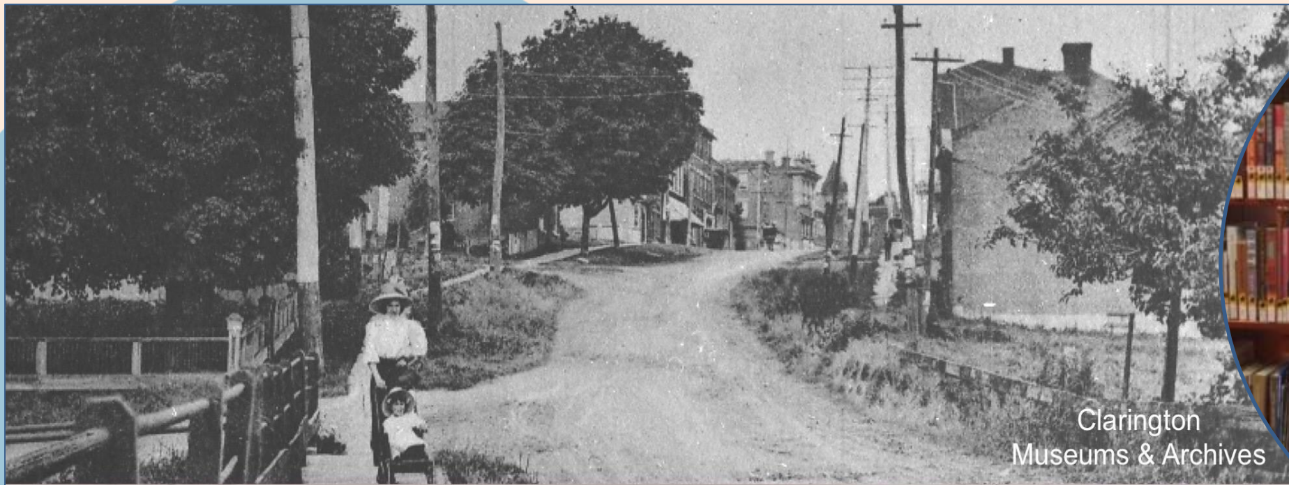
Clarington Museums & Archives