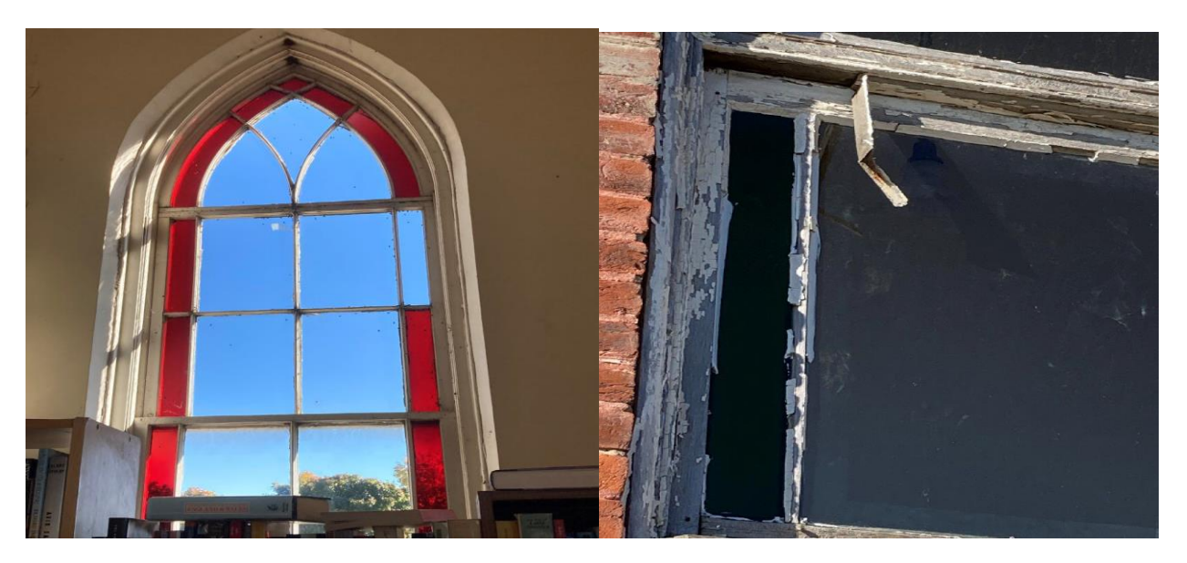
Figure 3 Current status windows and frames