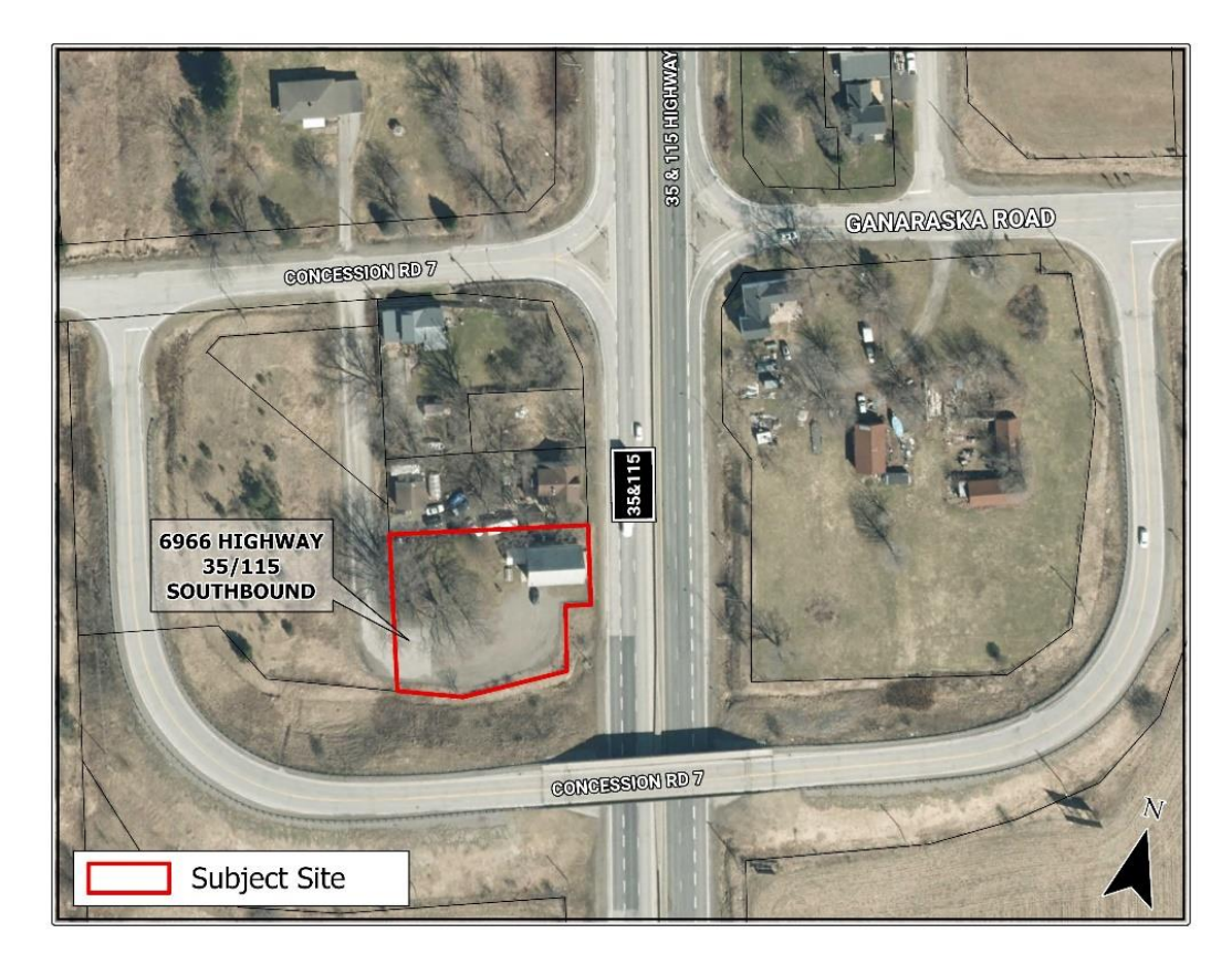
Figure 1 The property location

1.1 The property at 6966 Highway 35/115, Kirby Church, was built in approximately 1880 in the Gothic Revival style. It features a steeply pitched roof and simple lancet windows, decorative quoins, and hood surrounds. The building is an example of Wesleyan Methodist Church preserved in the Municipality. The property was designated by By-law 96-164 in 1996 for its heritage significance. (See Attachment 1).