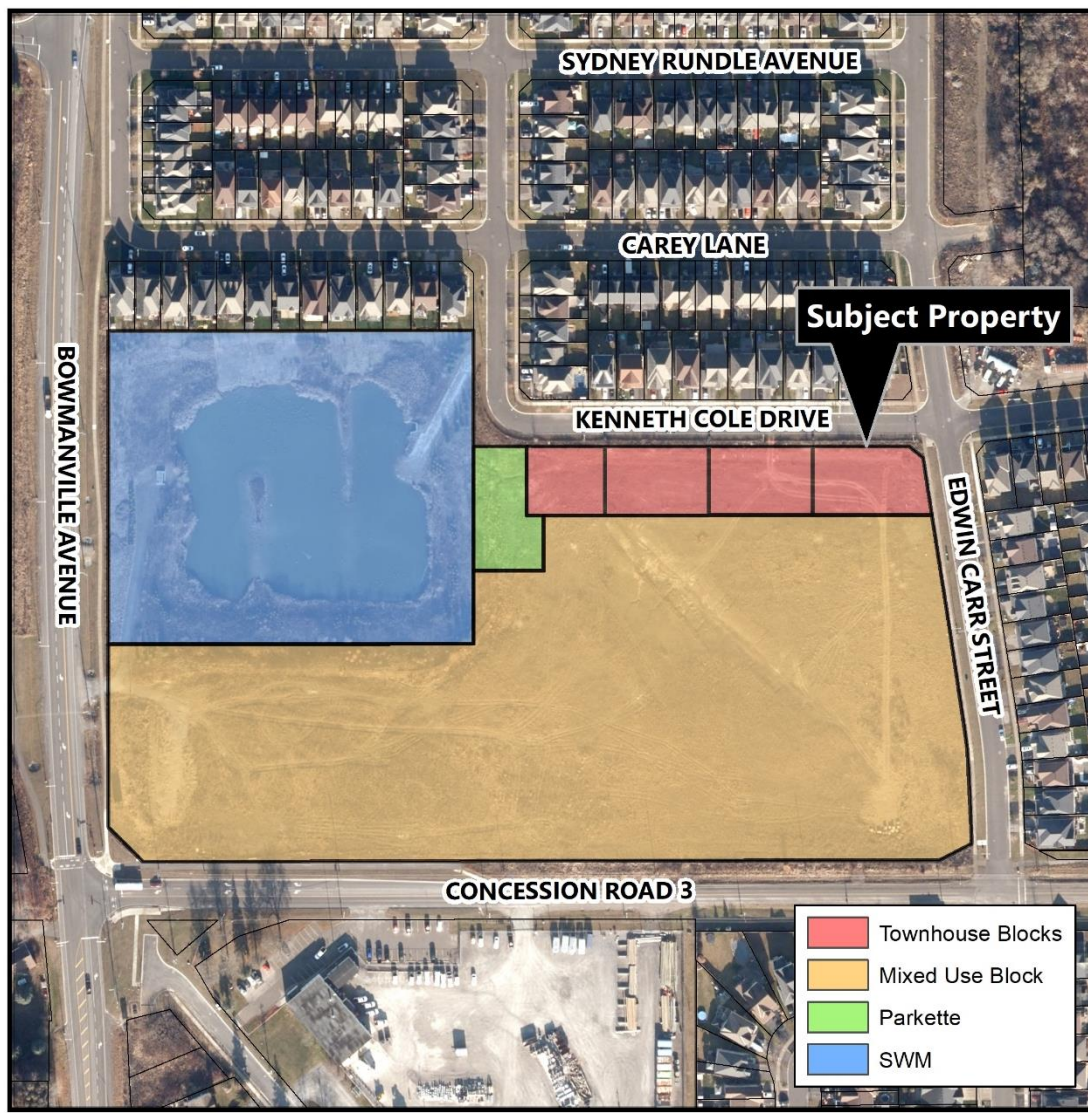
Figure 1 – Subject Lands

Northglen Neighbourhood (Figure 1). Each unit is proposed to have direct vehicle access off Kenneth Cole Drive which is an existing public street.