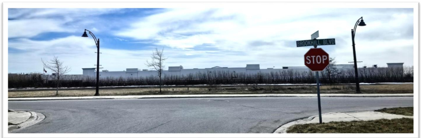
Figure 2: Subject Lands – Looking South along Brookhill Boulevard

West: Boswell Drive and long-term care home under construction.