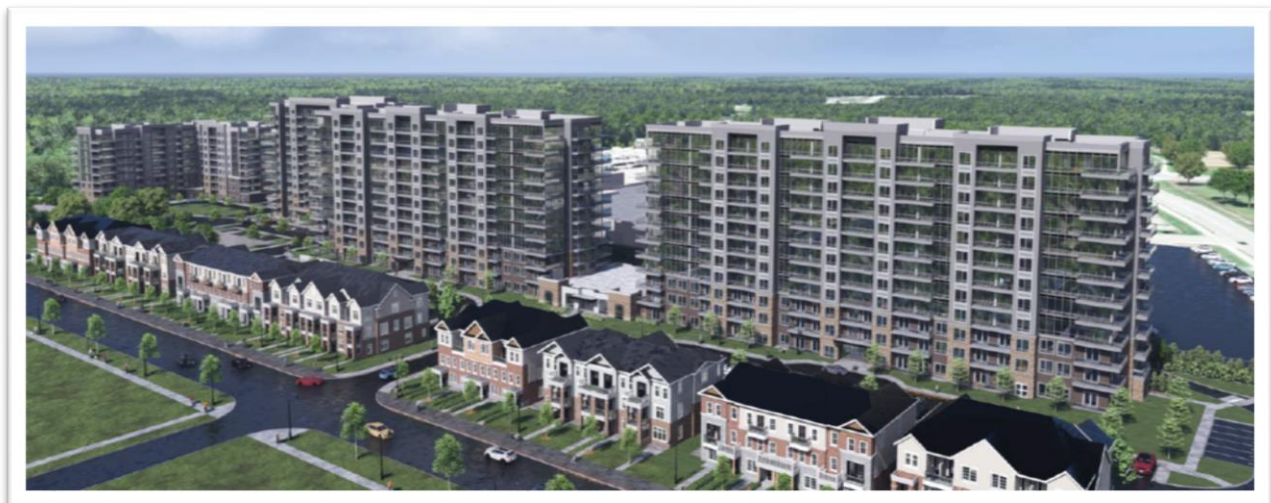
Figure 3: Applicant's rendering of the proposed townhouses and buildings along the north boundary of the site across Brookhill Boulevard.