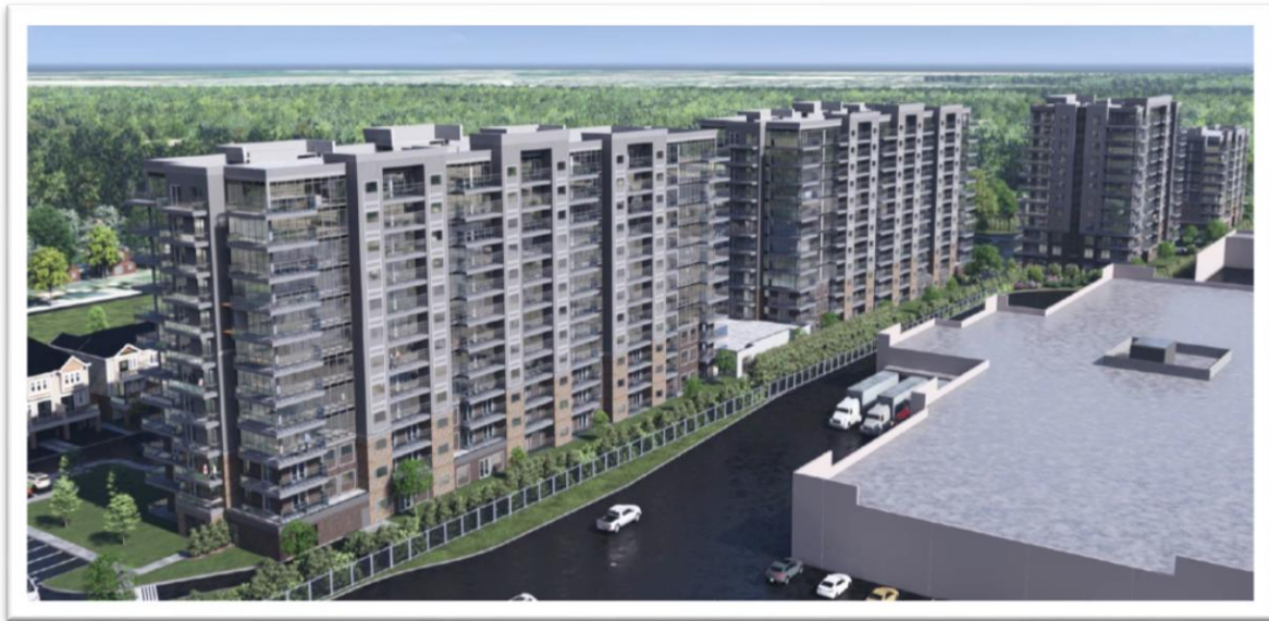
Figure 4: Applicant's rendering of the proposed buildings and townhouses along the internal road network.