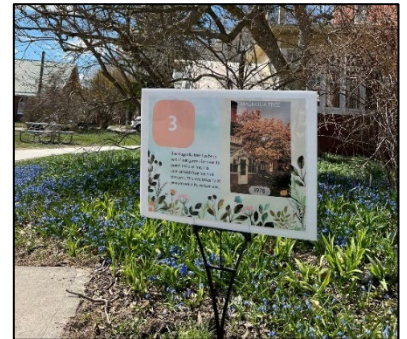
Image: Celebrate Earth Day, Garden Walk signs on the museum grounds

On April 22 nd , the museum sites hosted an Earth Day program promoting enjoying nature and protecting the environment. Participants toured Waverley Place, planted seeds to take home and walking the grounds for the historic Garden Walk