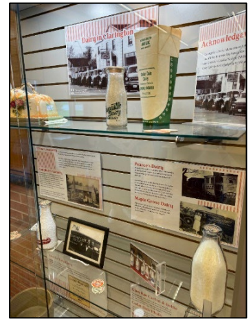
Image (right): Newcastle Library case featuring objects from local dairies

Image (left): Orono Library exhibit case with a history of the Waddell home and other Orono stories