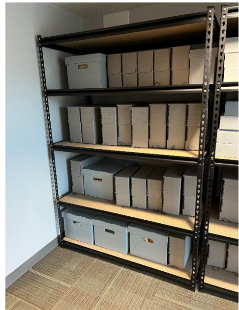
Image: Returned archival materials in temporary storage, ready for cataloguing

MuseumPros removed the next Phase of archival materials selected for treatment. These materials include oversized paper documents, framed photographs and diaries.